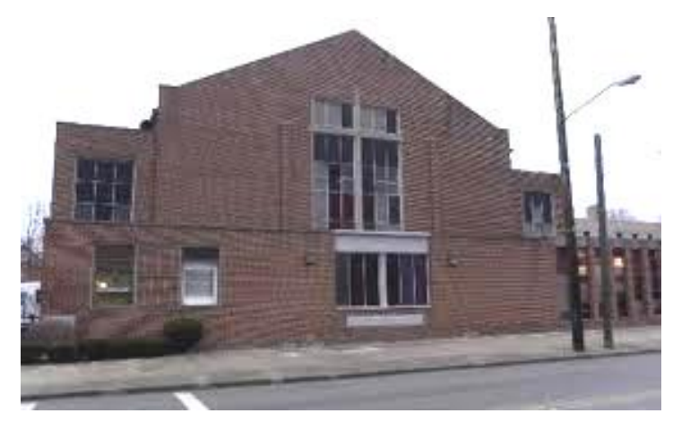
Live Strong: Homeless African American Men and the Church