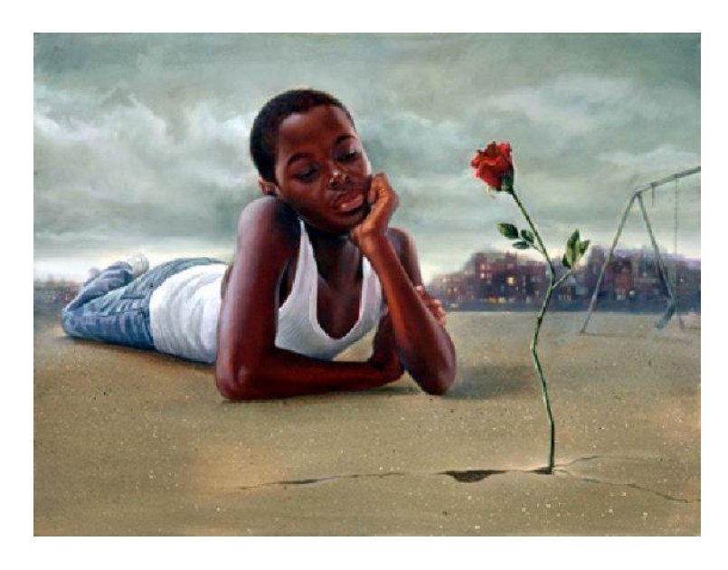
IV. Songs That Speak to the Moment

An African proverb states, "Wisdom does not come overnight." I am sure many would agree with this proverb, for wisdom is birthed through struggle, yet emerges as something admirable and worthy of our attention. The following image can be used for a bulletin cover as it represents the ability to rise amidst the hard circumstances of life. It also reminds us that someone is always watching and learning from how you choose to rise.