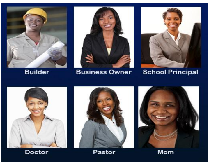
WOMEN'S DAY (March is Women's History Month)