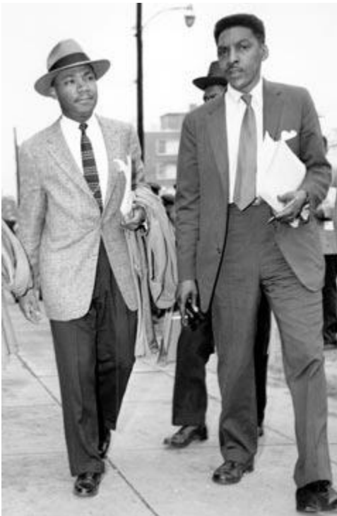
Bayard Rustin with Martin Luther King, Jr. in 1956

Today, the United States is still struggling with many of the issues Bayard Rustin sought to change during his long, illustrious career. His focus on civil and economic rights and his belief in peace, human rights, and the dignity of all people remain as relevant today as they were in the 1950s and 60s.