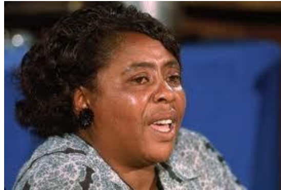
Fannie Lou Hamer