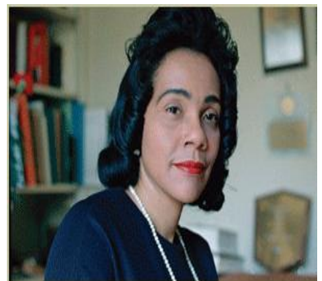
Coretta Scott King