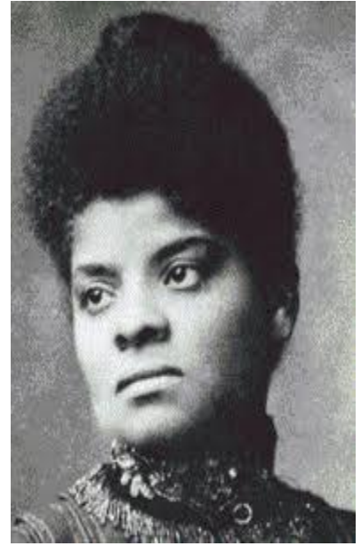
Ida B. Wells