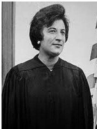
Constance Baker Motley