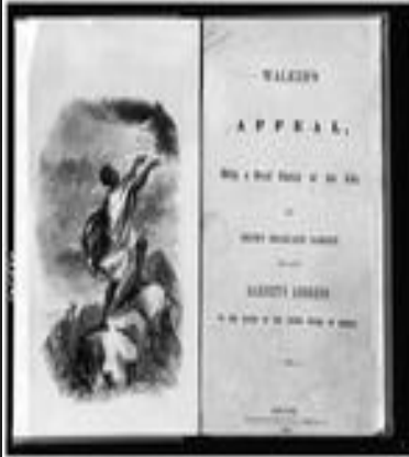
David Walker's Appeal