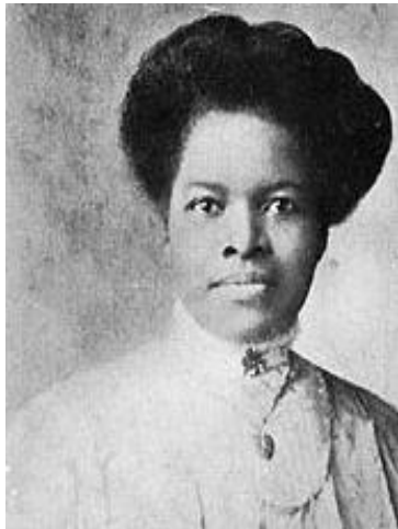
Nannie H. Burroughs