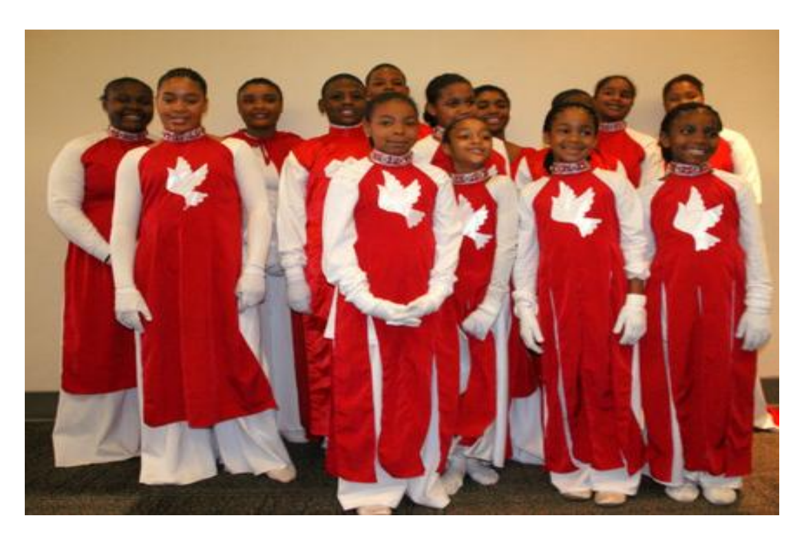
All God's Children Praise Dancers of Sacramento