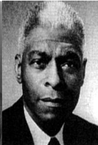
Benjamin E. Mays