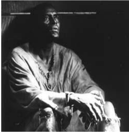
Nat Turner Rev. Jarena Lee