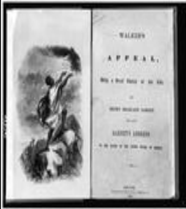
David Walker's Appeal