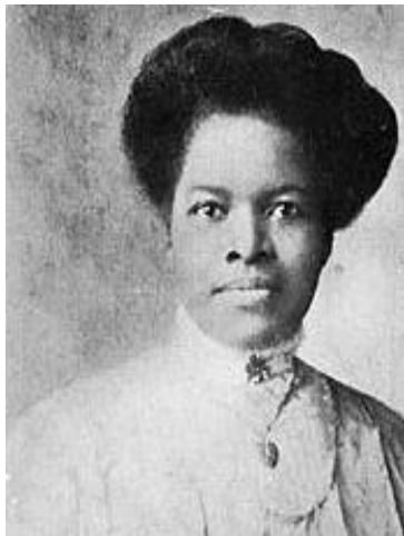
Nannie H. Burroughs Howard Thurman