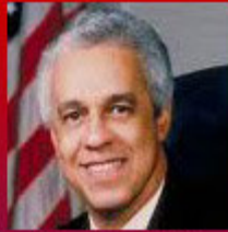
Douglas Wilder Virginia 1990-1994