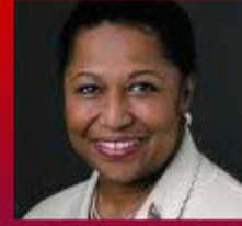
Carol Moseley Braun 1993-1999 Rep. Illinois