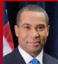
Deval Patrick Massachusetts 2007-Present