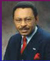
Roland Burris 2009-Present Rep. Illinois