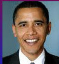
Barack Obama 2005-2008 Rep. Illinois