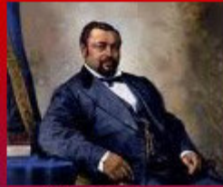
Blanche Bruce 1875-1881 Rep. Mississippi